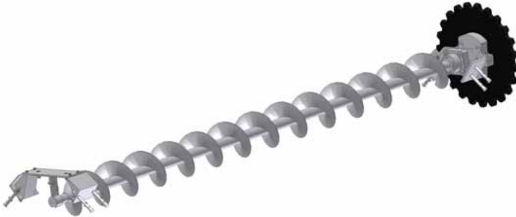
Typical Screw Collector

An alternative to the chain and flight cross collector, a screw conveyor can be utilized for the same purpose of concentrating the sludge into a sump pit. These can either be driven directly by a motor or an indirect chain drive (illustrated below). When these screw collectors span many hoppers or just a longer single hopper, hanger bearings are required.