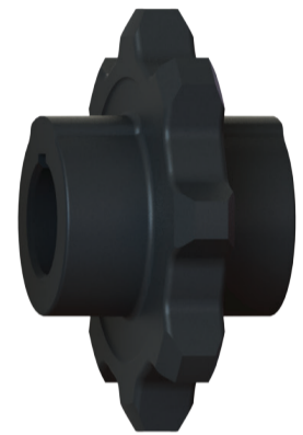
Type C Hub 2 Sides