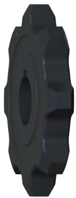
Type A No Hub

Contact Name: _____ Phone: _____ Email: _____