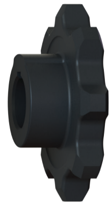
Type B Hub 1 Side