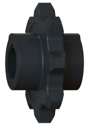
Type C Hub 2 Sides