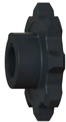
Type B Hub 1 Side