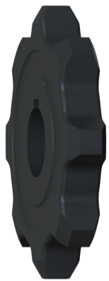
Type A No Hub

Contact Name: _____ Phone: _____ Email: _____